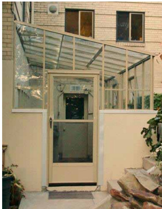
A walkout basement is a common entry for a home-attached greenhouse.

Our greenhouses are designed to install to the outside surface of an existing building and that could be siding, stucco, wood shakes or brick/ stone. We are frequently asked if the attaching wall will degrade faster than the other exterior walls of the building. In our experience, the temperature inside the greenhouse is a more controlled environment in terms of temperature and humidity and as such, the wall will not degrade as fast due to fewer fluctuations. People also ask if the extra humidity will cause rot or mould due to increased condensation. Increased condensation will be a problem for your wall and also harmful for your plants. Condensation can be easily controlled so that is not the case using standard ventilation procedures.